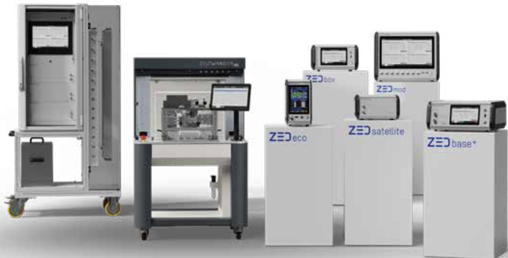
ZEDflex with ZEDcontrol

24/22 en Subject to error, misprints or alteration for reasons of technological advancement.